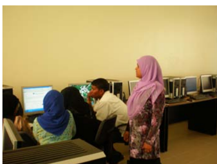
All PD activities are not workshops