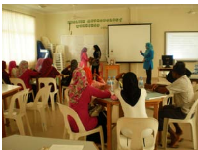
Make your workshop activity based. Lecturing the whole time bores people

After analyzing needs, it is necessary to recognize the findings in relation to the availability of resources (both human and material) for addressing these needs. This process is called prioritizing of needs. This requires the PD Coordinator to be the champion of the project to address the PD needs and to present the PD Needs Report in a comprehensible manner. In this way, action is more likely to be taken rather than the report gathering dust on a shelf (See Appendix E for a needs analysis done by a school)