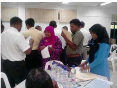
PD activities can be fun