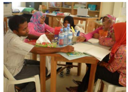
Group Work— A very effective method of adult training